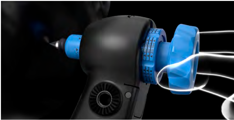
Integrated Pin Force Indication