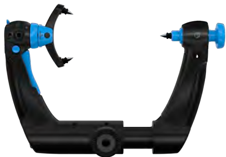
Skull Clamp Item no. 1101.001