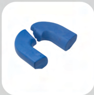
DELTA Adult Pad Product Code DELFAD-02