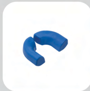
DELTA Paediatric Pad Product Code D-2002

Delta Surgical are pleased to offer Neurosurgeons our single-use horseshoe headrest pads in both adult and paediatric sizes.